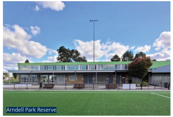
Arndell Park Reserve