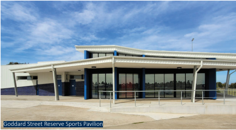
Goddard Street Reserve Sports Pavilion